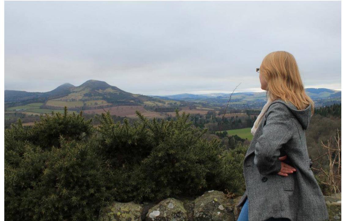
Scott's View, Scottish Borders Region